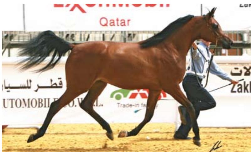
■ Like peas in a pod: Marylla and Magora (both Gazal x Margotta) from Blommeröd Arabstuteri, Sweden.

Following her big brother Marwan, Pianissima went to the United States; Janow Podlaski leased her for several years. The year 2008 is a new beginning on european grounds for the now five-year-old mare. She turned her back on the USA, won a senior champion title in Saudi Arabia and returned to her home stud Janow Podlaski on January 25th. This year she is supposed to compete at the larger senior shows in Europe. There is no other mare in sight, yet, who could stop Pianissima's triumph.