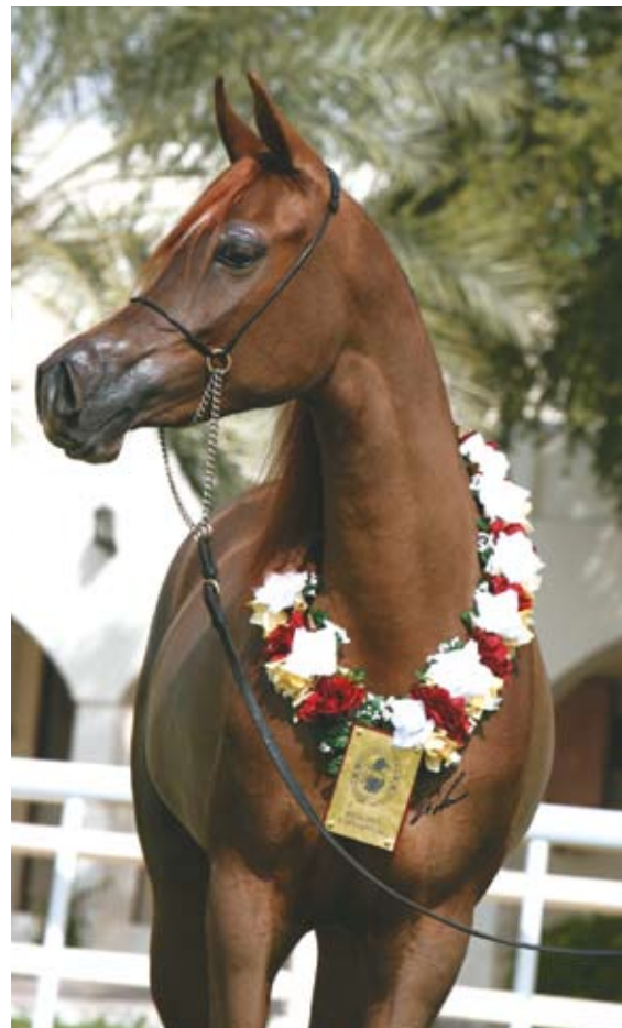
■ Nations Cup Top Five PS Rose Of Marwan (Marwan Al Shaqab x PD Rose Mahogany) from America.