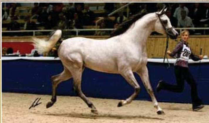
■ The Egyptian-Russian bred El Sid (Al Lahab x Swana) became Senior Champion. He was bred by Karl-Heinz Stöckle.

The national champions have all been bred by their owners and all come from the country with the blue and white chequered flag. It seems that the centre of German Arabian breeding is located in Bavaria.